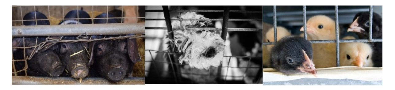
Cages, stalls and crates prevent animals from engaging in normal healthy behaviours.

There's nothing healthy, enriching, or pleasant about being put in a cage and left there. Animals who are crated for long periods of time become lonely, sad, and aching to be free. Pet owners need to hear what crate enthusiasts aren't interested in talking about. The evidence and research, not to mention the protest of our whimpering and crying dogs, are telling us to stop. No species is biologically designed to be warehoused in containers. Containers are best suited for storing items that don't breathe.