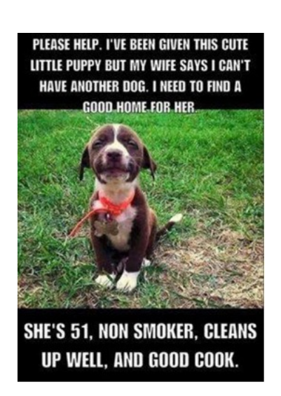
Meme creator unknown

In the '60s, a zoo in Canada received four polar bears presented to them by the Hudson's Bay Company as gifts. Captive wild animals are often driven crazy, but since they have no choice, cannot will themselves to die, they are forced to serve out a life sentence, in whatever wretched environment