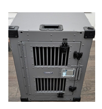
A 'High Anxiety' Crate

Dogs have minds of their own, and they respond to the commands of their owners because they value harmonious relationships. Dogs want peace. So, when our dogs strongly resist our commands, it likely means what we are requesting of them is highly threatening and disturbing. A significant number of dogs are genetically predisposed to being fearful and anxious, (Tiira, Sulkama, Lohi, 2016) without the added pressures from us. The activities and environments we place them in can ease or exasperate their anxiety. It is beyond our ability to genetically alter their physiological responses, or reprogram their neuronal circuits, to lessen that anxiety. What we can do is stop putting them in crates. Yet disturbingly, the crating industry's response to the fear dogs experience when crated has produced