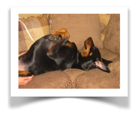
What relaxed & safe looks like.

There are no stats on how many animals are crated at any given time. There are no records of how many animals have died in crates. No doubt, the number is astronomical. It doesn't have to be this way. With gentle guidance dogs can be given freedom and choice. Millions of dogs live freely in their own homes as part of the family. Yours can too.